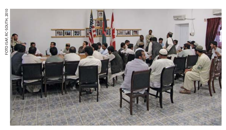
RC-South organized a series of vendor outreach events for local contractors in Kandahar City

Over the last months, measurement of campaign success has evolved from an 'end state' to a 'transition tempo'. There is much to say about a transition strategy for Afghanistan. The ISAF-