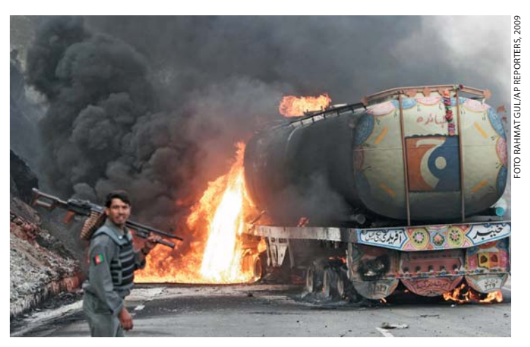
An Afghan police official secures the road after one of the many attacks on ISAF fuel convoys

brokers' and they have further extended their power base by obtaining contracts from ISAF and its civilian counterparts, such as the United Nations Assistance Mission in Afghanistan (UNAMA) and the United States Agency for International Development (USAID). Many of them are former Mujahideen commanders and they still have their own militias, which are now called PSCs.