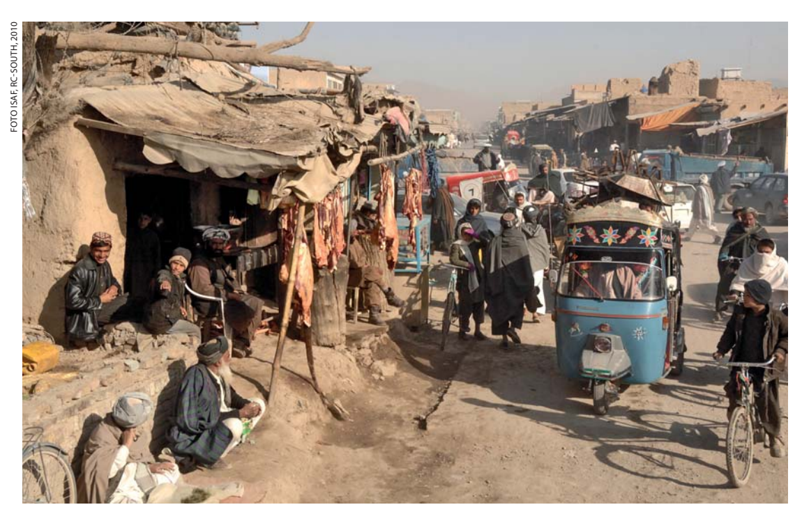
Afghan First Policy aims to increase ISAF's procurement of local goods and services in order to enable economic development of poor regions, like this suburb of Kandahar City

economic and political influence, thus further weakening democratic institutions. In this way, the Afghan state remains disconnected from its democratic powerbase – the people – and the grievances that fuel the insurgency are maintained. Therefore, counterinsurgency warfare, which is in essence a battle for the hearts and minds of the people, must include an anti-corruption course of action.