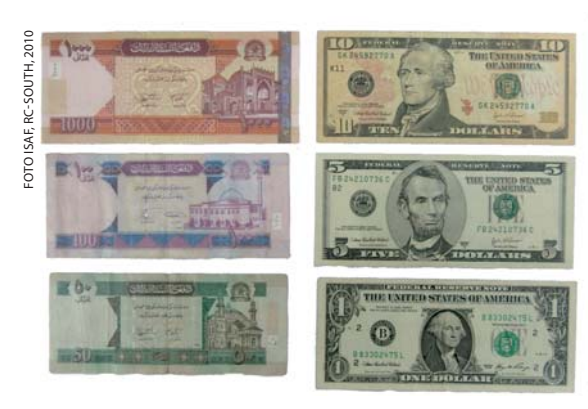
ISAF's contract payments in USDs (right) reduce the population's confidence in their currency (left) and their government

Upon delivery of contracted products and services, Afghan (sub)contractors are usually paid, either in U.S. dollars (USDs) or in Afghanis.