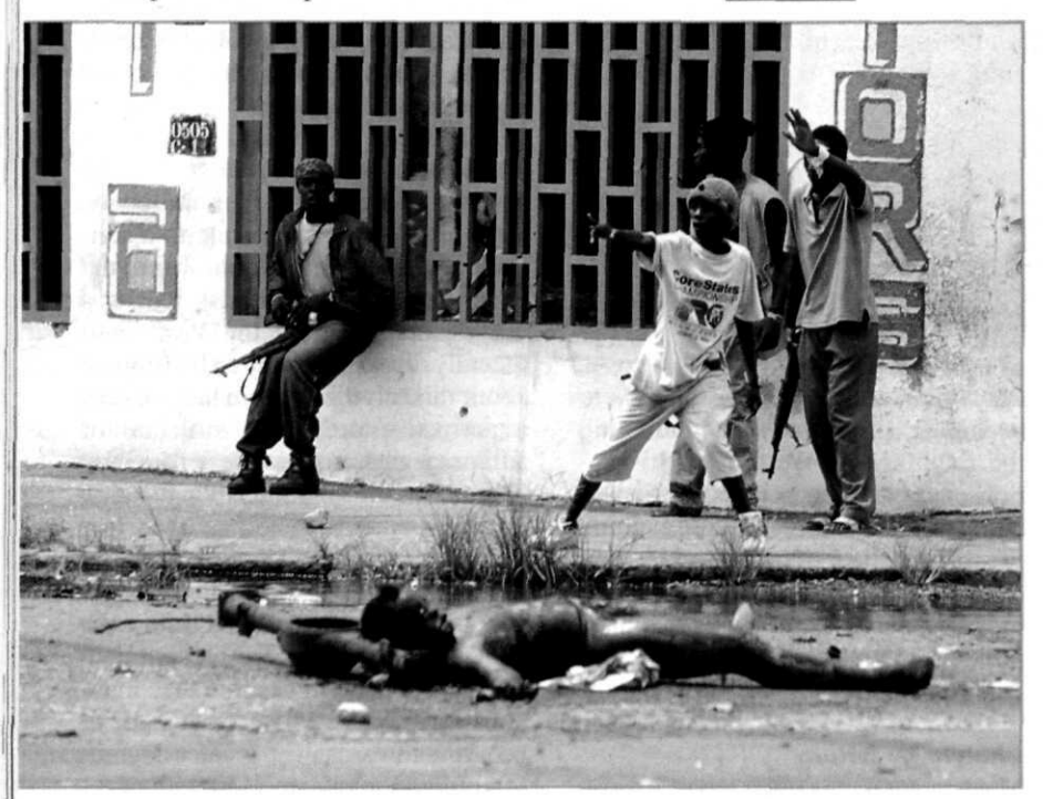
The situation in Liberia

None of this actually started the war in Liberia.