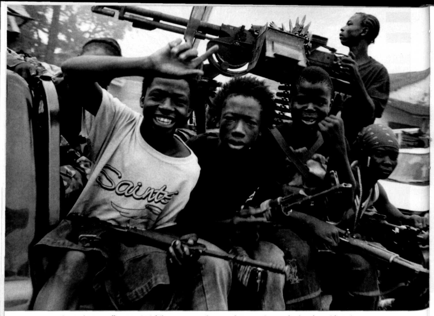
Ganta is a small town, 250 kilometers north-east of Monrovia, on the border with Guinne... (Photo: ©Teun Voeten, Ganta, Liberia, June 23rd 2003)