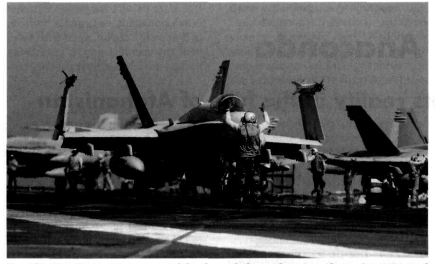
An F/A-18C Hornet is prepared for launch from the aircraft carrier USS Carl Vinson (CVN 70) in a strike against Al Qaeda terrorist training camps and military installations of the Taliban regime in Afghanistan (2001)

te to Prince Sultan Air Base in the desert south of Riyadh.<sup>6</sup>