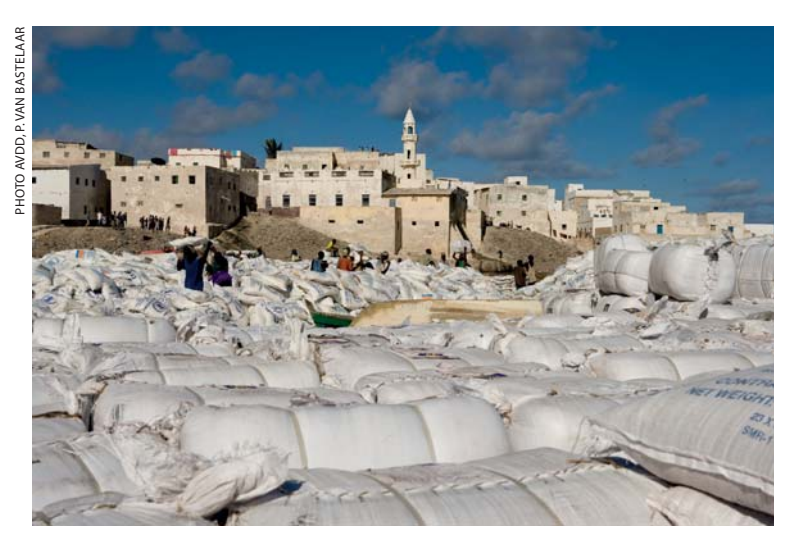
Protection by the Dutch naval vessel Evertsen resulted in the successful bringing ashore of food in the Somali harbour of Marka

they have to act often does not provide clear guidelines. For example should the Somali pirates be seen as criminals or as a military threat? When the German frigate Emden patrolled the Somali coast in 2008 in search of possible Al Qaeda vessels, it came upon pirates attacking a Japanese tanker. It had to let the pirates go, as it could only intervene against a 'terror' threat.<sup>48</sup> German law requires parliamentary approval for foreign military deployments due to historic uneasiness about German military aggression. As many experts argued that the UNSC resolutions provided the legal mandate for tougher actions against Somali pirates, in December 2008 the German government approved the participation of 1 400 naval personnel in Operation Atalanta.<sup>49</sup>