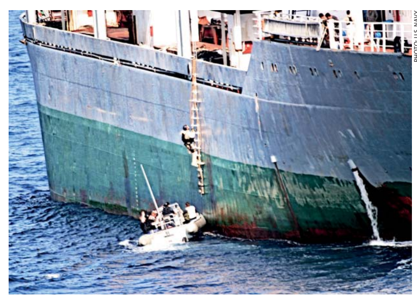
Boarding team members from guided-missile destroyer USS James E. Williams board the North Korean cargo vessel Dai Hong Dan to provide medical assistance

that she was hijacked. A helicopter from the destroyer investigated the Dai Hong Dan and ordered the hijackers to surrender. The North Korean crew overpowered the pirates, killed two and captured five others. Three North Korean crewmen were seriously wounded and were taken aboard the American destroyer for treatment.<sup>64</sup> The fight against piracy surely makes for strange bedfellows.