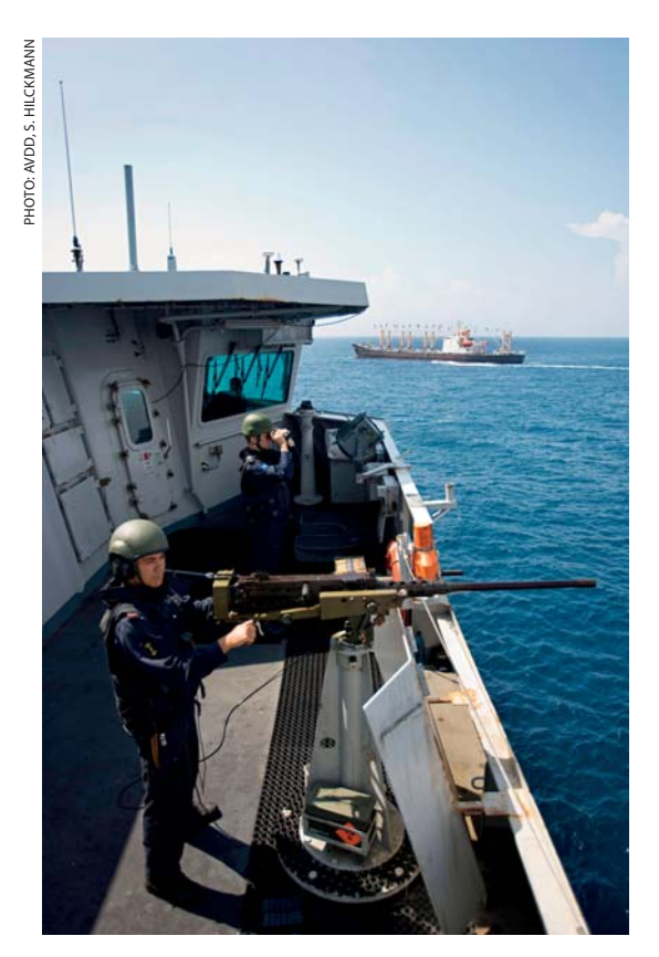
The Dutch frigate De Ruyter protects a ship carrying supplies for the World Food Program to the harbour of Mogadishu

presence increased fundamentally from 2008 onwards. Combined Task Force (CTF) 150 was for a long time the most conspicuous international, or coalition, maritime undertaking in the region. It was launched by the United States in response to the 9/11 attacks in 2001 as the maritime element of Operations Enduring Freedom . Its operational area included the Gulf of Aden, Gulf of Oman, the Arabian Sea, Strait of Hormuz, Red Sea and the Indian Ocean, while payal vessels from Canada.