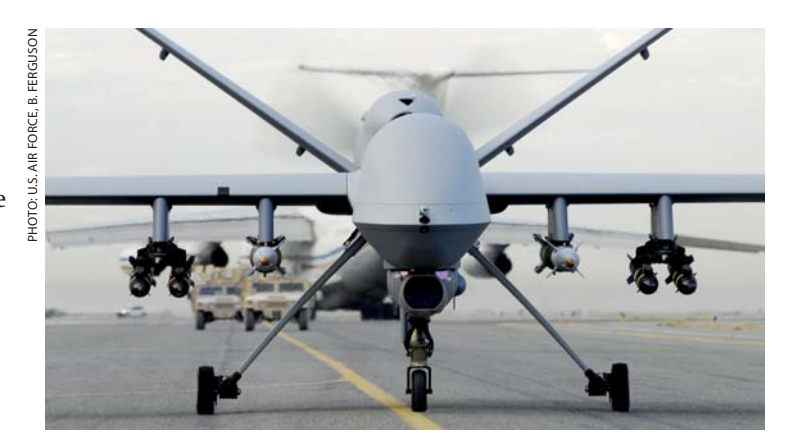
Recently, the U.S. Africa Command started using the unmanned aerial vehicle Reaper to monitor pirate activity off the Somali coast

Various agencies, bodies and states, would have to work together to improve maritime safety and security, harbour security and environmental care. Often the mere presence of a coastguard and civilian policing agencies does much to enhance maritime security. However, maritime policing and coastguards are insufficient in the region and international