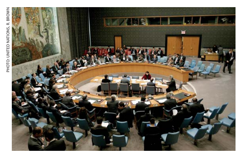
The Security Council meets to consider the situation in Somalia as well as the issue of pirates and high seas piracy in the region, November 2009

media took place during 2008. These included the Danish-owned tug Svitzer Korsakov , the French luxury passenger yacht Le Ponant , the Spanish trawler Playa de Bakio , the Ukrainian Faina and the Saudi super tanker Sirius Star . Ransom was paid in all cases, but the French later managed to capture six of the pirates involved in the Le Ponant hijacking.<sup>22</sup>