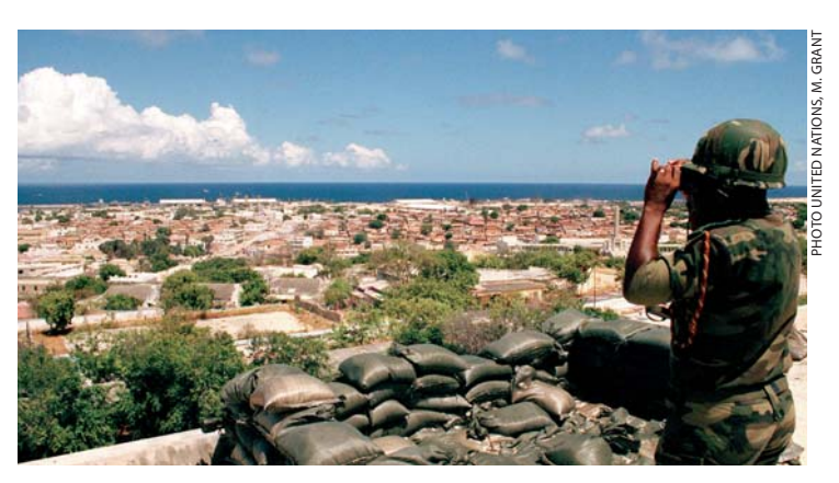
A member of the Nigerian contingent of UNOSOM II surveying the city of Mogadishu, May 1993.

to the use of the sea. Serious environmental degradation has taken place as countries in the region claim vast damage as a result of illegal fishing, reef destruction and the depletion of many species. Also, unknown quantities of illicit (often toxic and radioactive) waste have been dumped in Somali waters. Though the full extend of it is unknown, it certainly poses a serious threat to the environment and people. Also in humanitarian terms the impact has been severe. Besides the famine in Somalia, food shipments and the distribution of relief supplies are often threatened, while human trafficking and smuggling abounds.